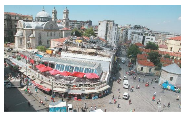
Taksim – Stavrodromio Square. All the shops belongs to Baloukli Foundation. The Church shown is Agia Triada (1881)