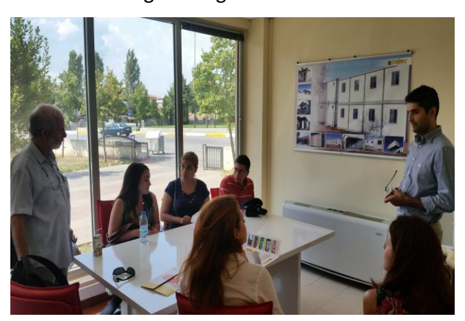
Classes at SME Incubator center in Pantichi