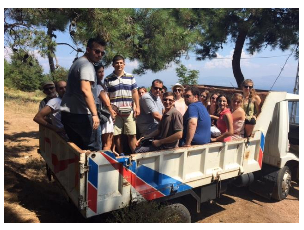
Participants going to Christos Monastery in the island Antigoni (with the only available motor vehicle)